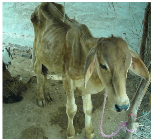
Figure 10. Emaciated <2-year-old calf afflicted with severe skeletal fluorosis. Note wasting of body muscles and bulging lesions on legs.

Other symptoms: According to the information given by the cattle owners and veterinarians, other signs of chronic F intoxication such as intermittent diarrhoea, colic, urticaria, and bloating were also present in the fluorosed animals. Among the cows, repeated abortions, stillbirths, and irregular estrous cycle were also