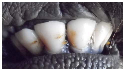
Figure 3. Mild form of dental fluorosis in a calf.

Dental fluorosis: Out of 24 calves and 75 cows, 10 calves (41.7%), and 28 cows (37.3%) exhibited various grades of fluorotic dental mottling. Their anterior teeth were bilaterally striated and were horizontally light to deep yellowish in colour (Figures 3–5).