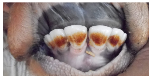
Figure 5. Severe form of dental fluorosis (deep yellowish coloration) in a calf.