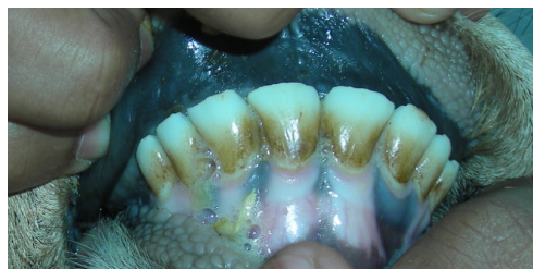
Figure 7. Moderate form of dental fluorosis in a calf.

In some calves, the dental staining was light brown to deep brownish or black (Figures 6–8). Generally, the staining in calves was more condensed, well stratified, and homogeneous, but in older cows it appeared in mosaic form. In severe form, irregular wearing of teeth and recession and swelling of gingiva were also observed. In older cows pronounced loss of tooth supporting alveolar bone with recession and bulging of gingiva and exposed cementum of incisor roots were common. Overall, the severity of dental mottling was more progressive with advancing age in the cattle.