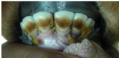
Figure 8. Severe form of dental fluorosis (deep brownish coloration) in a calf.

Skeletal fluorosis: Eight (33.3%) of the 24 calves and 30 (40.0%) of the 75 cows showed evidence of skeletal fluorosis. On careful examination and palpation of mandibular, scapular, tarsal, metatarsal, carpal, and cage regions of these animals, diffused to well-marked bony outgrowths (periosteal exostoses) were apparent (Figures 9–10). These animals were physically weak, indolent, and reluctant to move or stand. In these animals, mild to severe intermittent lameness and snapping sounds, especially in the hind legs, stiffness of leg tendons, and wasting of main mass of hind quarters and shoulder muscles were also observed.