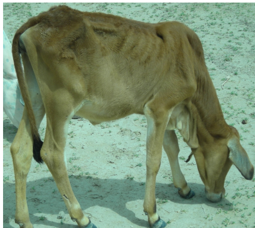
Figure 9. Emaciated <2-year-old calf afflicted with moderate skeletal fluorosis.

Skeletal fluorosis: Eight (33.3%) of the 24 calves and 30 (40.0%) of the 75 cows showed evidence of skeletal fluorosis. On careful examination and palpation of mandibular, scapular, tarsal, metatarsal, carpal, and cage regions of these animals, diffused to well-marked bony outgrowths (periosteal exostoses) were apparent (Figures 9–10). These animals were physically weak, indolent, and reluctant to move or stand. In these animals, mild to severe intermittent lameness and snapping sounds, especially in the hind legs, stiffness of leg tendons, and wasting of main mass of hind quarters and shoulder muscles were also observed.